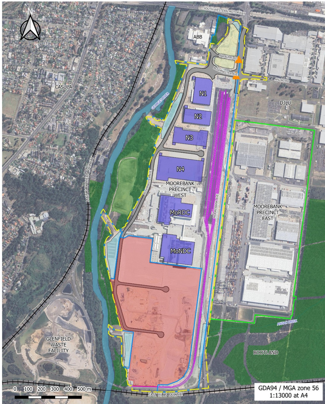
Figure 1-1 MPW Stage 2 development location and layout