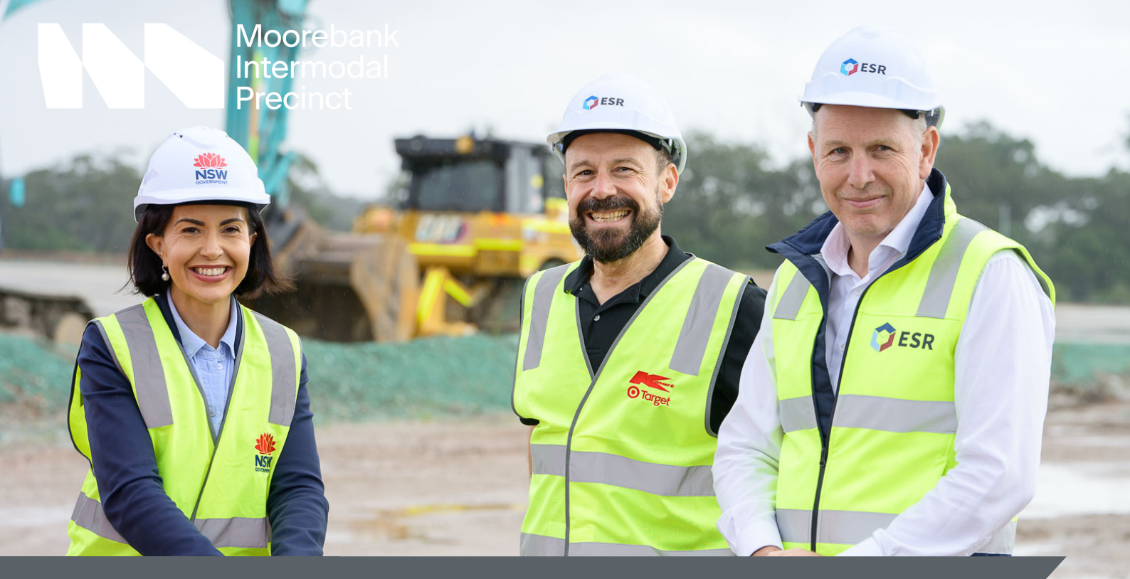
Moorebank Avenue Realignment Smoking Ceremony