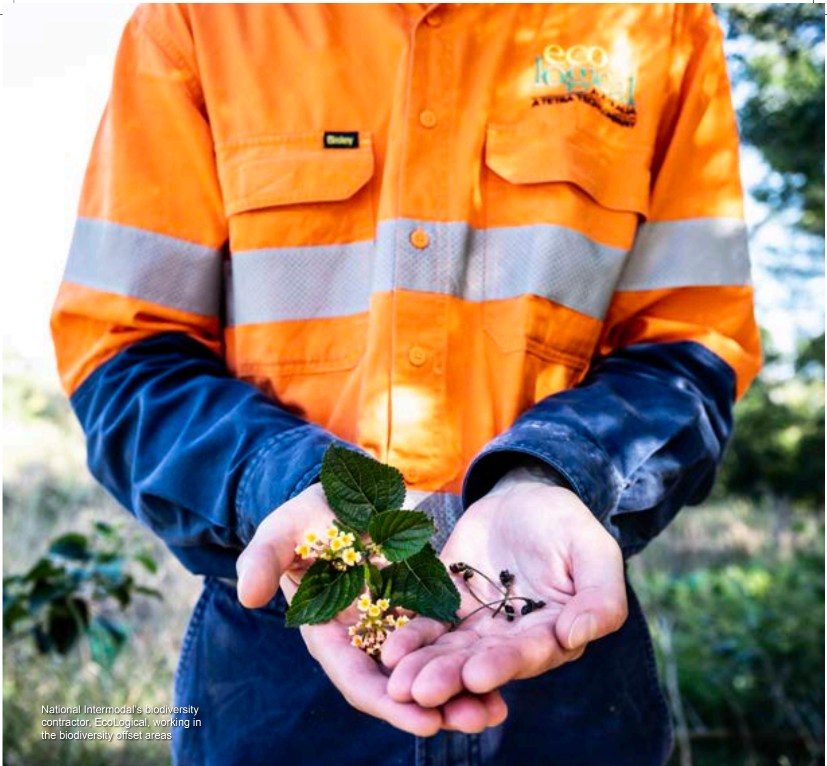
National Intermodal's biodiversity contractor, EcoLogical, working in the biodiversity offset areas