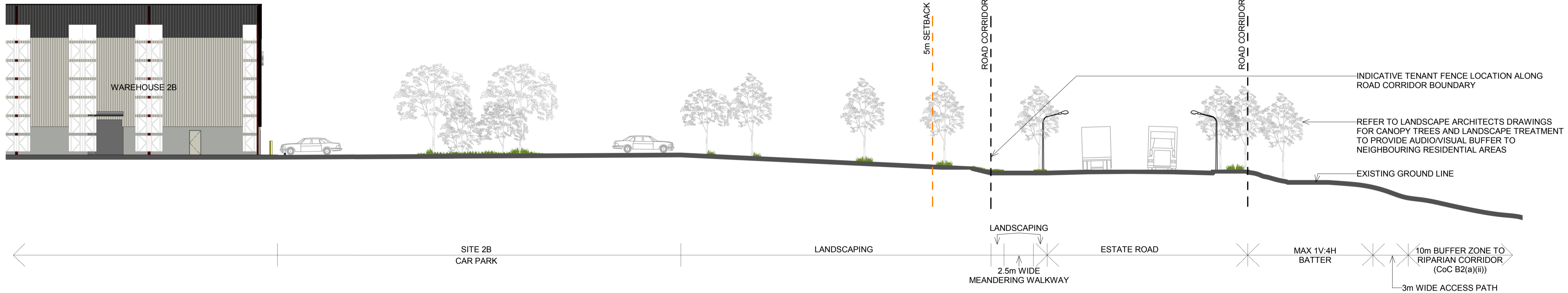
2 ROAD SECTION 02 - WAREHOUSE TO ROAD 1 : 200

NOTE: REFER TO CIVIL ENGINEERS DETAIL FOR SURFACE LEVELS