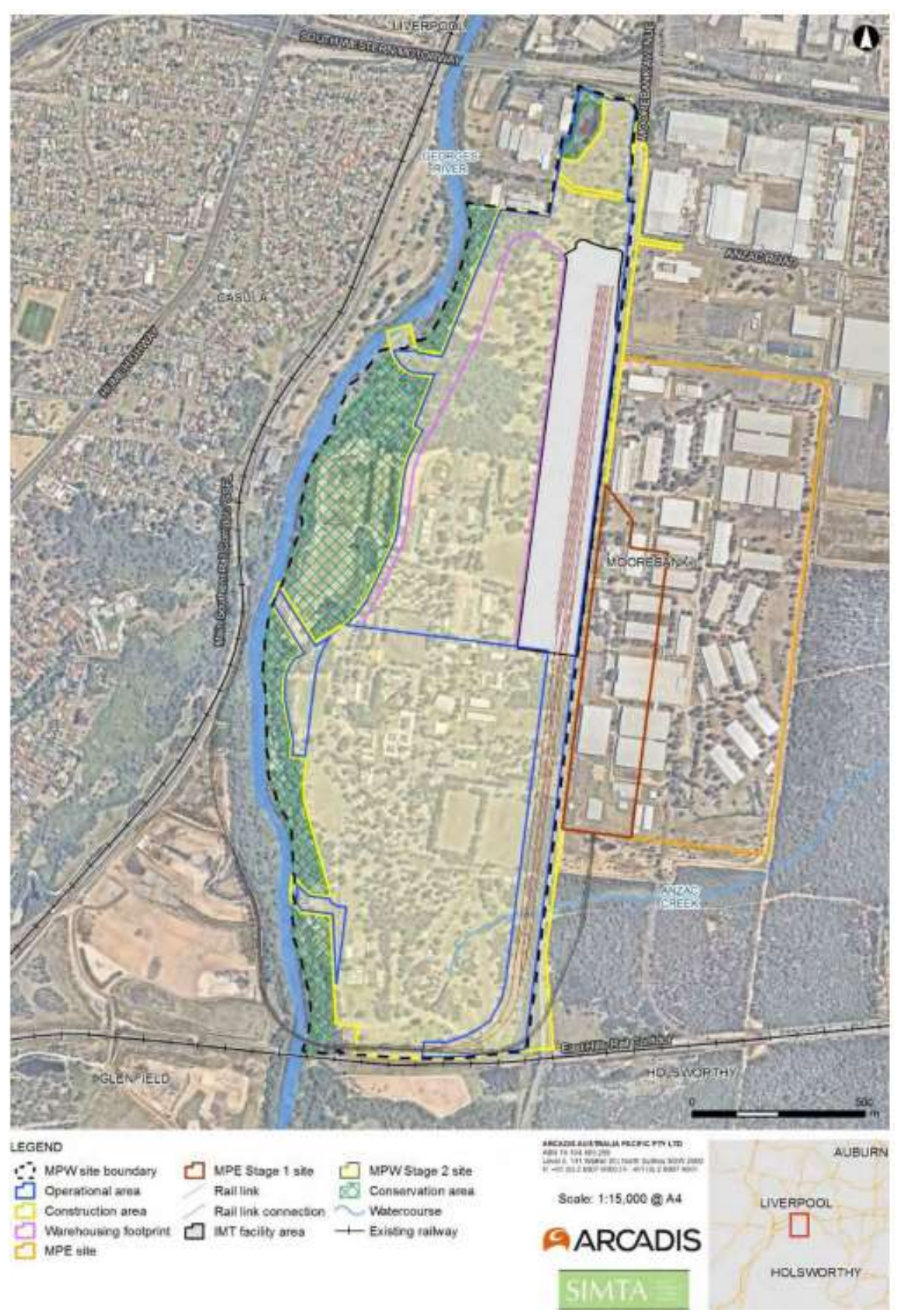
Figure 1: Project location (Moorebank Precinct West – Stage 2 Proposal – Environmental Impact Statement, Arcadis 2016)