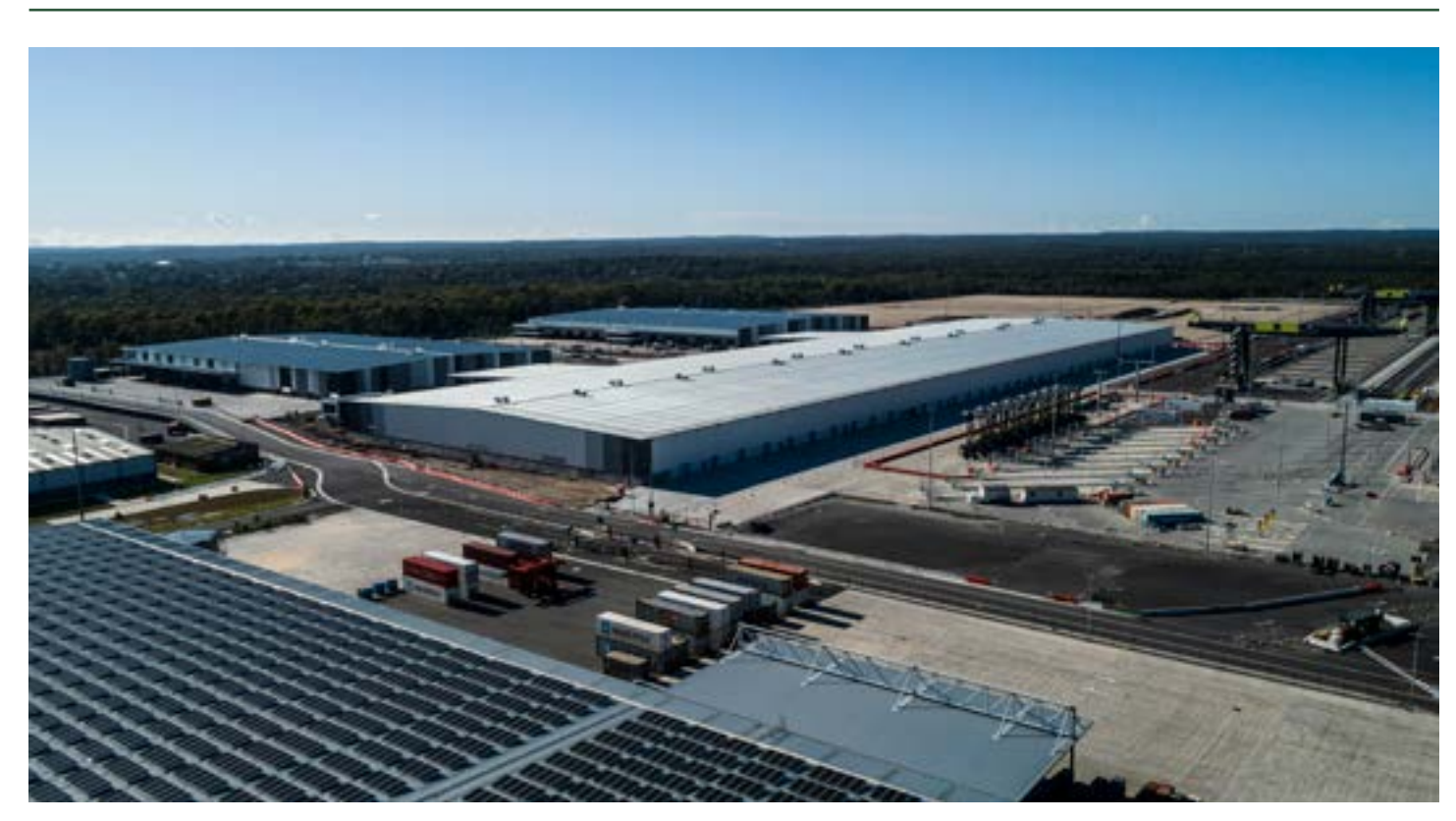
Two new warehouses have been completed on Moorebank Precinct East in 2020, with a third in the final stages of construction. New tenants are now operating from the site, joining Target, which was the first tenant to call Moorebank Logistics Park home.