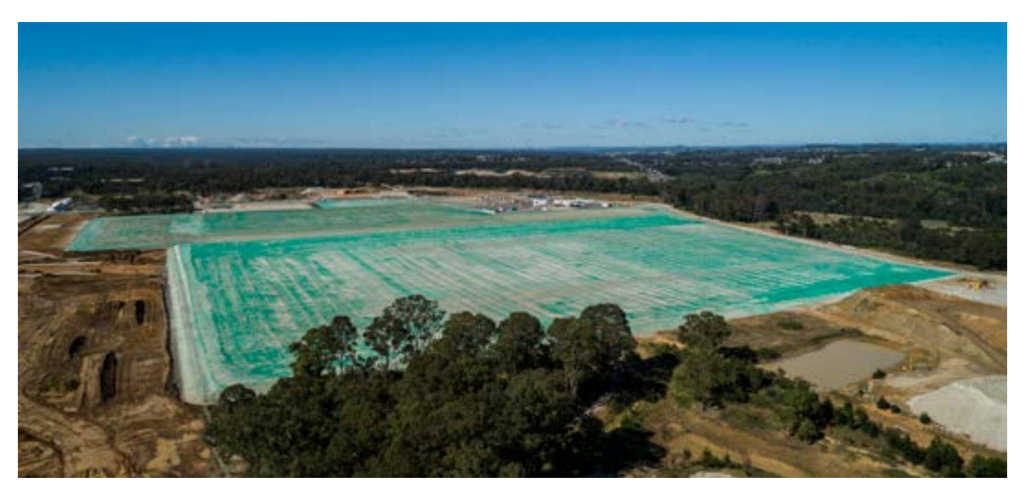
A significant amount of our work on Moorebank Precinct West in 2020 has been in preparation of the site for Woolworths' two new distribution centres, which will cover a significant portion of the centre of our site next to the future interstate rail terminal.