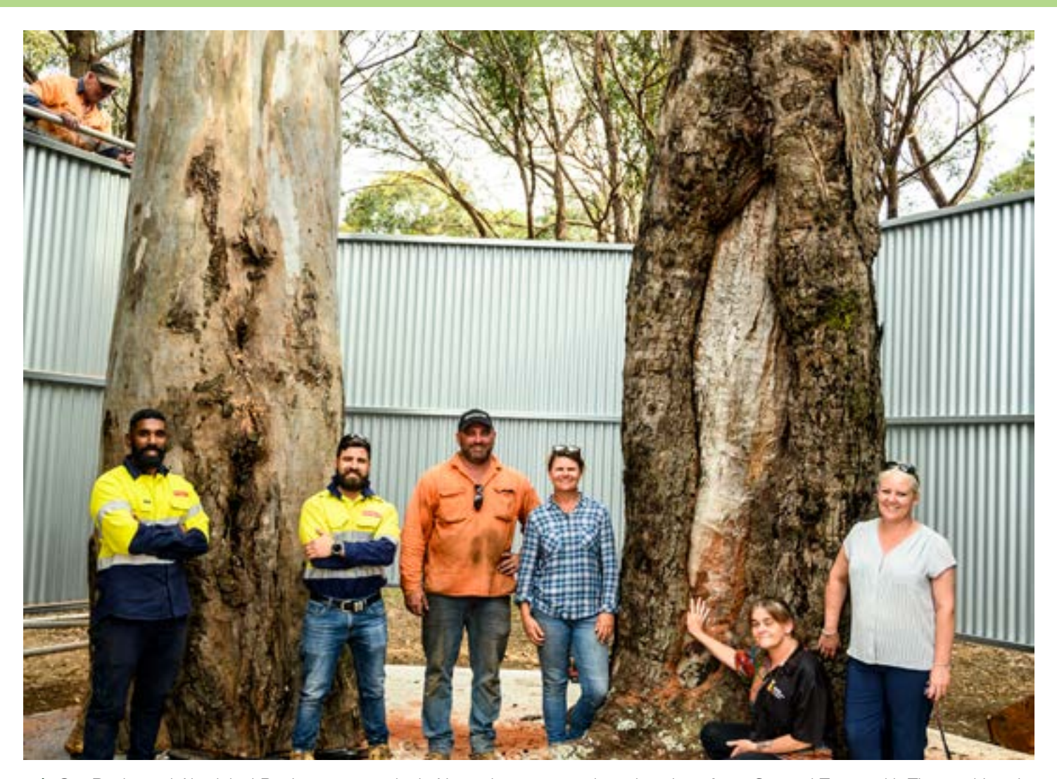
Our Registered Aboriginal Parties were on-site in November to supervise relocation of two Scarred Trees, with Tharawal Land Council taking ownership of the pieces.