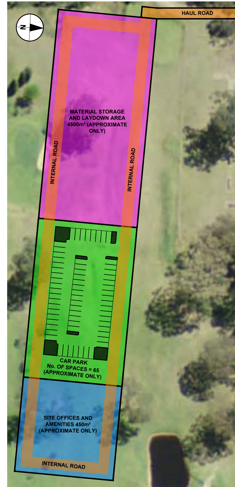
GEORGES RIVER COMPOUND (TOTAL AREA 9800m 2 )

NOTE: 1. AREAS AND CARPARK SPACES APPROXIMATE ONLY