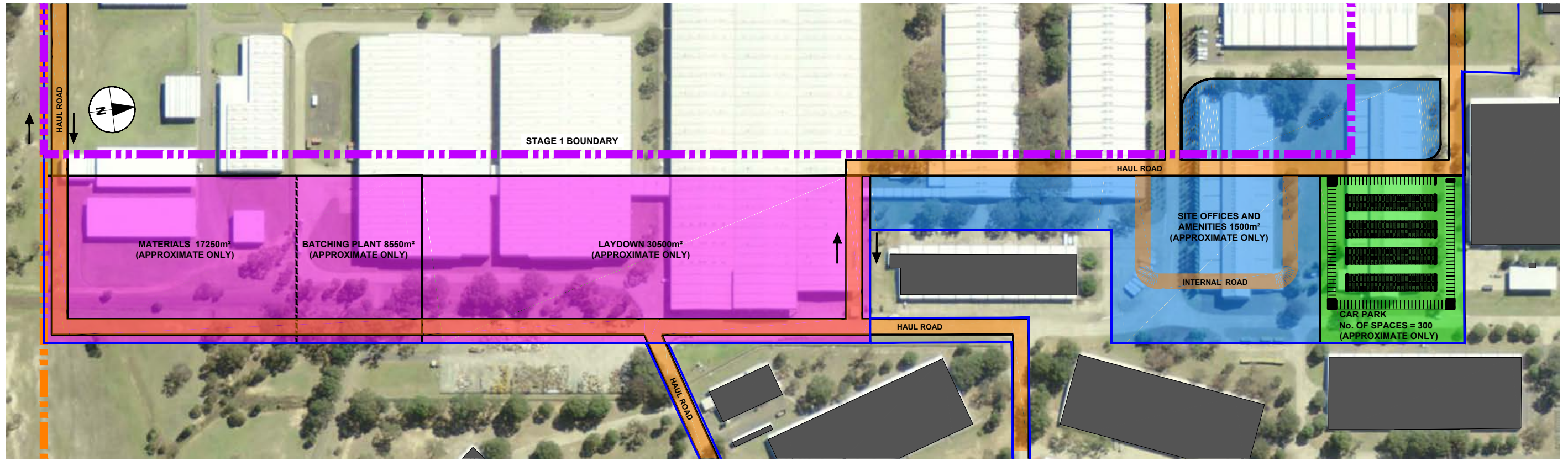
IMT COMPOUND (TOTAL AREA 94300m²)

Last saved by: PRICEDY (2015-02-25) Last Plotted: 2015-03-04 Filename: P:\603X\6037283\SKE\CAD\25-SKETCHES\6037283-SKE-10-GE-0002.DWG