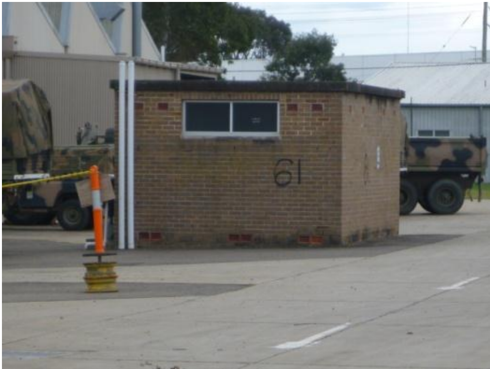
Figure 3: Example of masonry building with steel roof