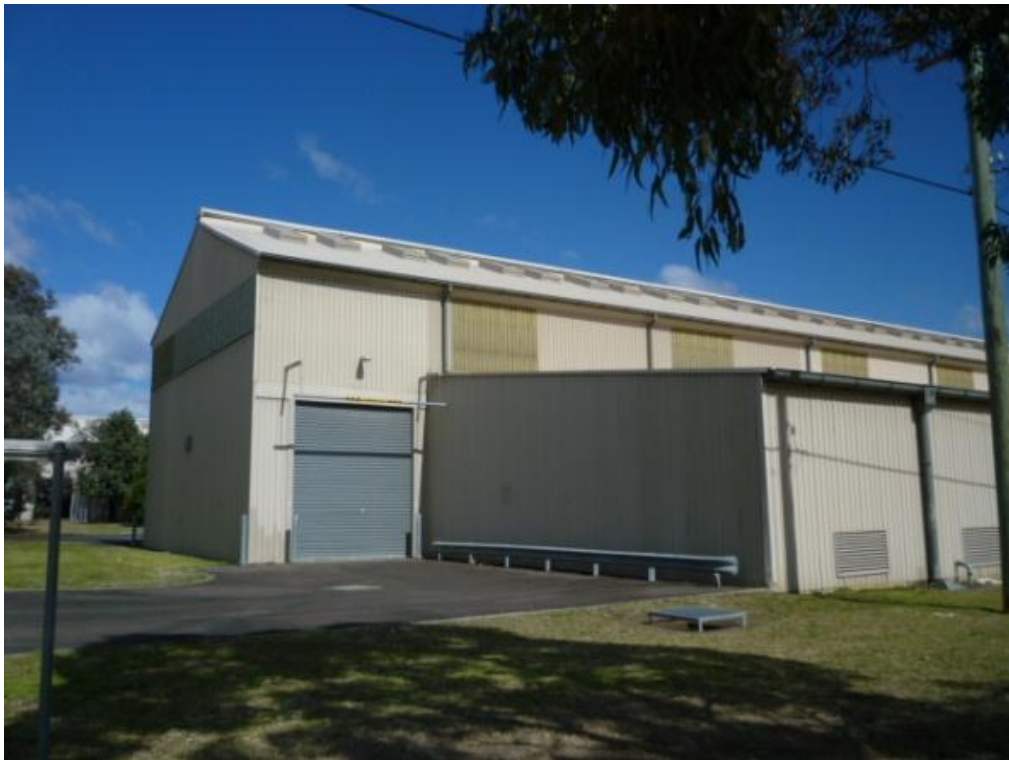
Figure 4: Example of steel roof and wall building