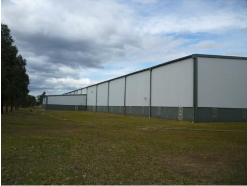
Figure 2: Example of steel roof and wall building