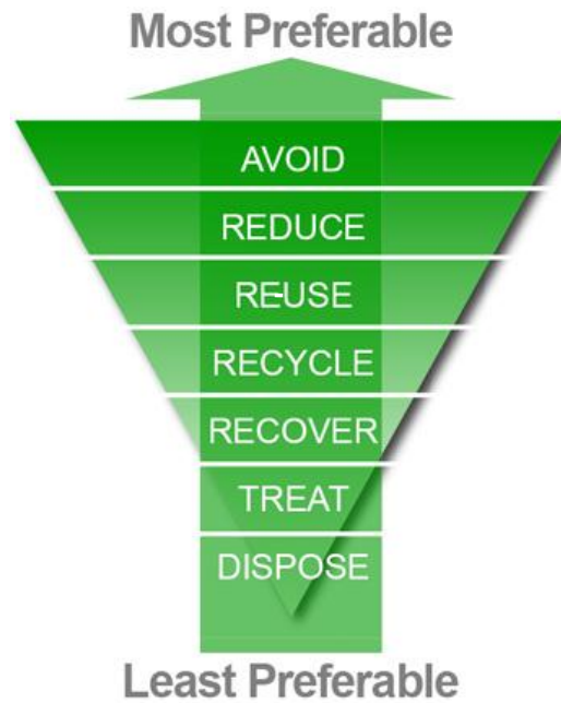
Figure 6: Waste Management Hierarchy (Zero Waste South Australia, 2010)

These measures are supported by the following: