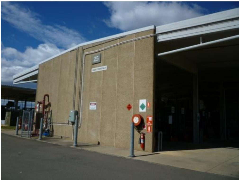
Figure 5: Example of building with reinforced concrete panels and steel roof