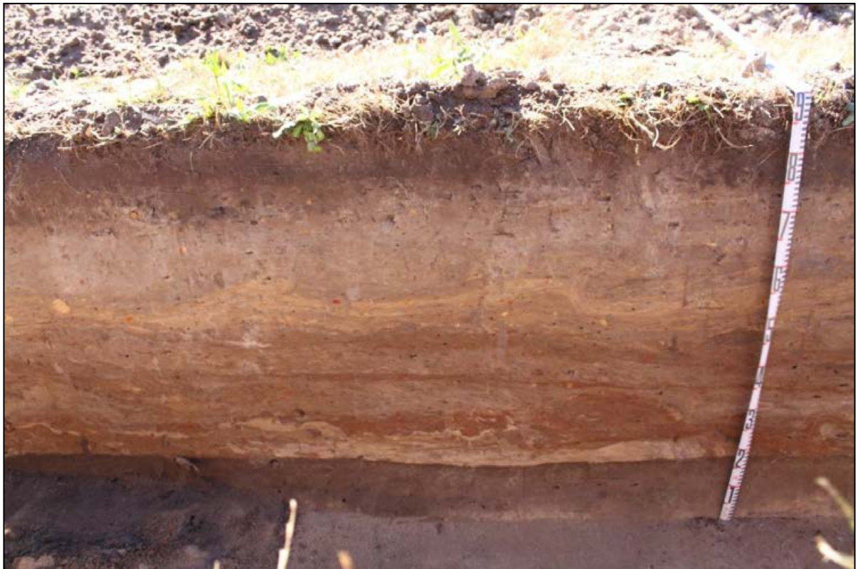
MHPAD1 Transect 8, northern profile showing layers of fill over old soil horizon