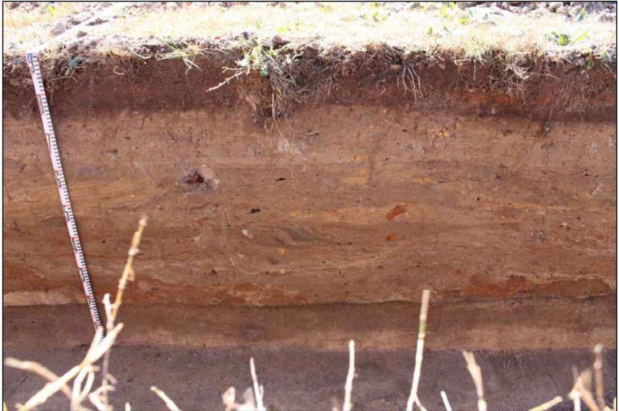
MHPAD1 Transect 8, northern profile showing layers of fill over old soil horizon