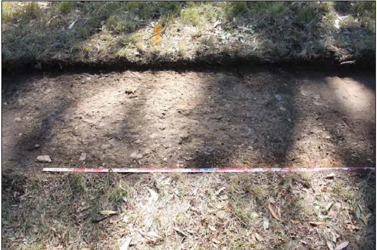
MHPAD1 Transect 5, diagonal pathway at western end of transect