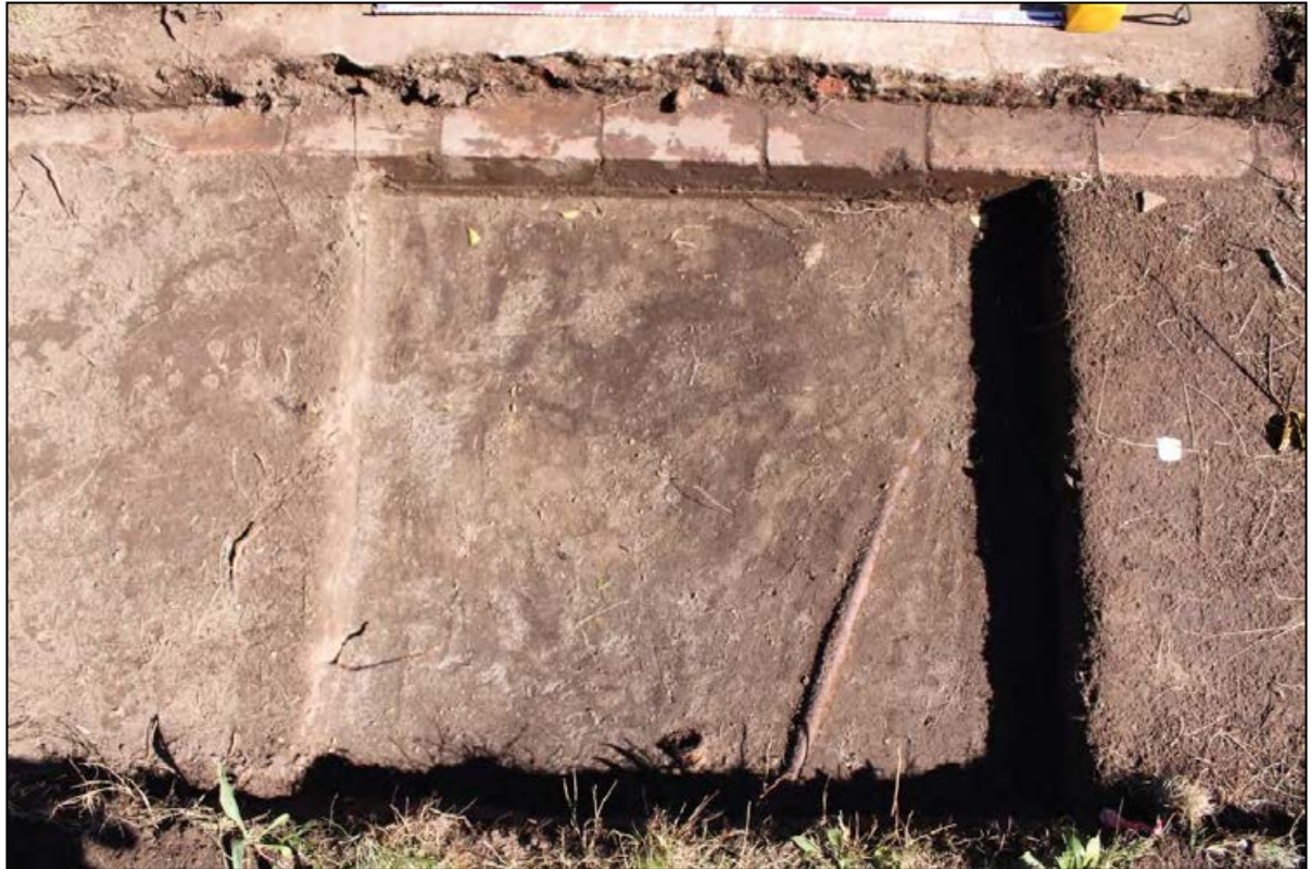
MHPAD1 Transect 3, Square 44, Context 9