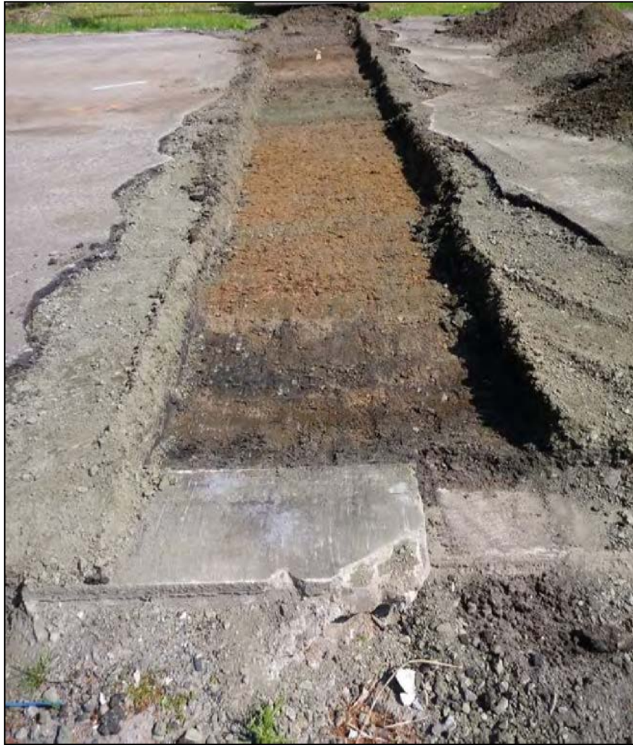
MHPAD3 Transect 1 Cut 3, looking west