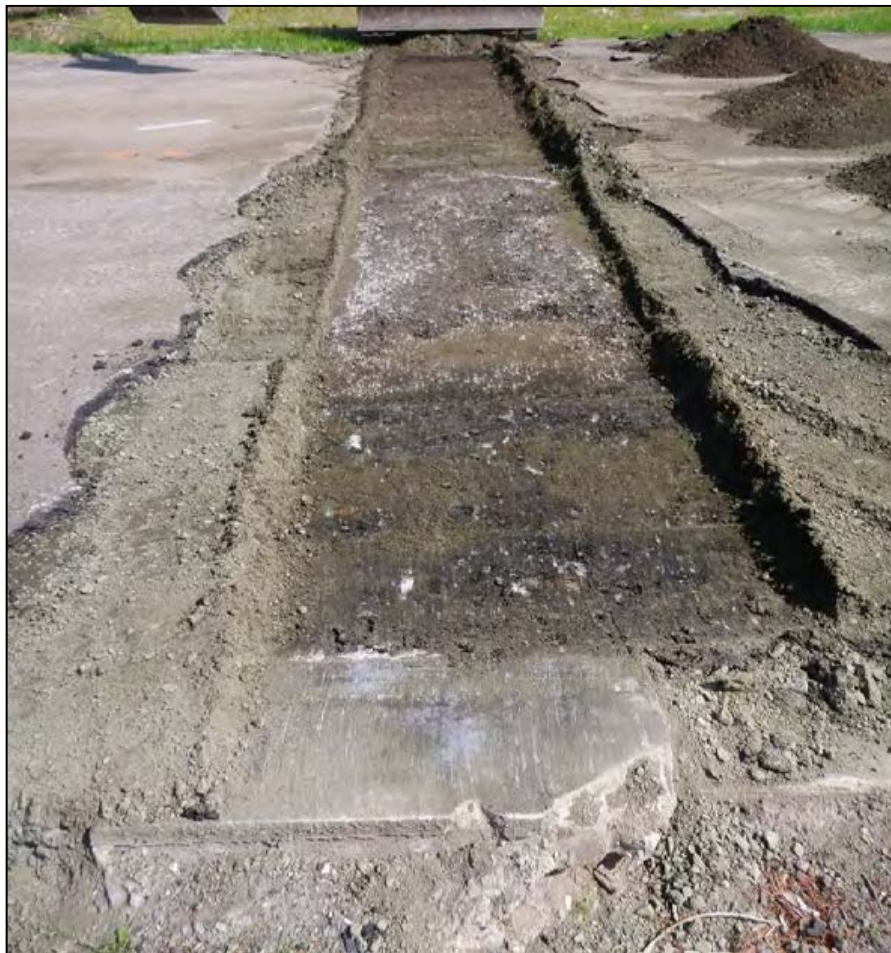
MHPAD3 Transect 1 Cut 2, looking west