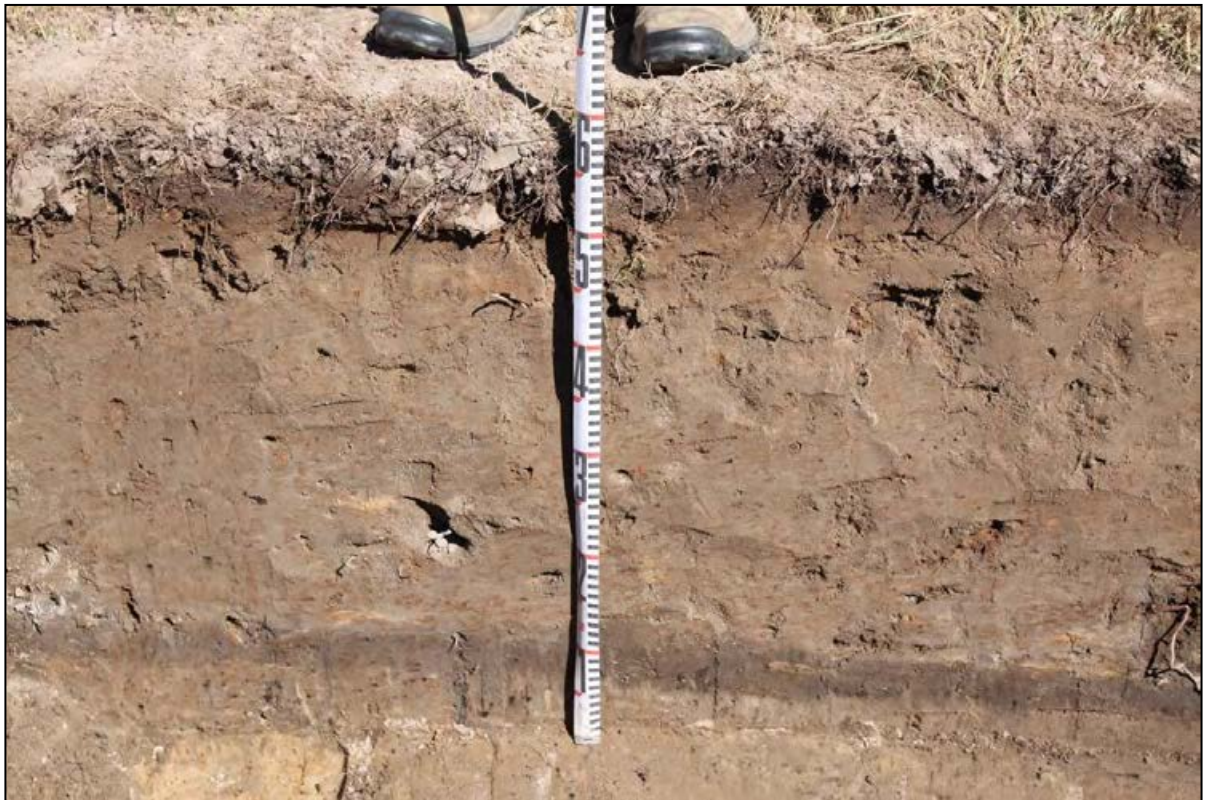
MHPAD1 Transect 9, portion of southern profile showing layers of fill over old soil - horizon