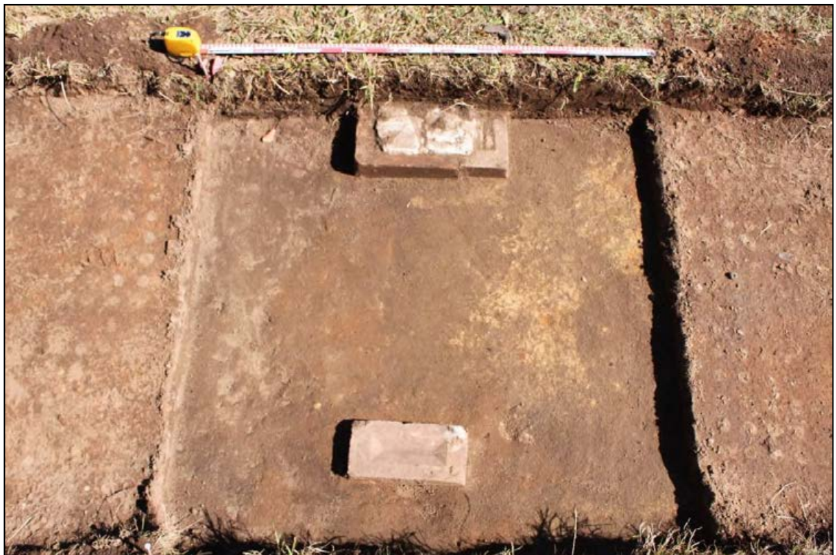
MHPAD1 Transect 3, Square 78, Context 11