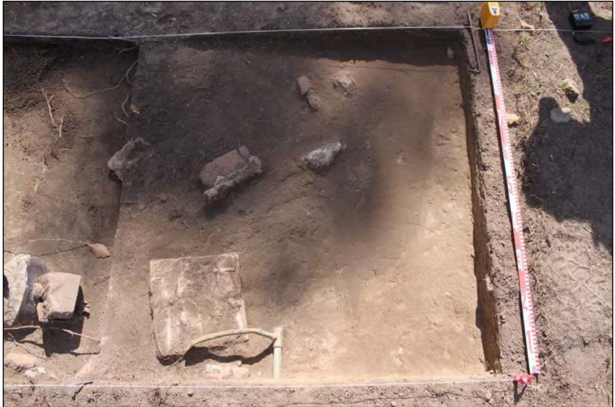
MHPAD2 – AH8a - Context 9, looking north