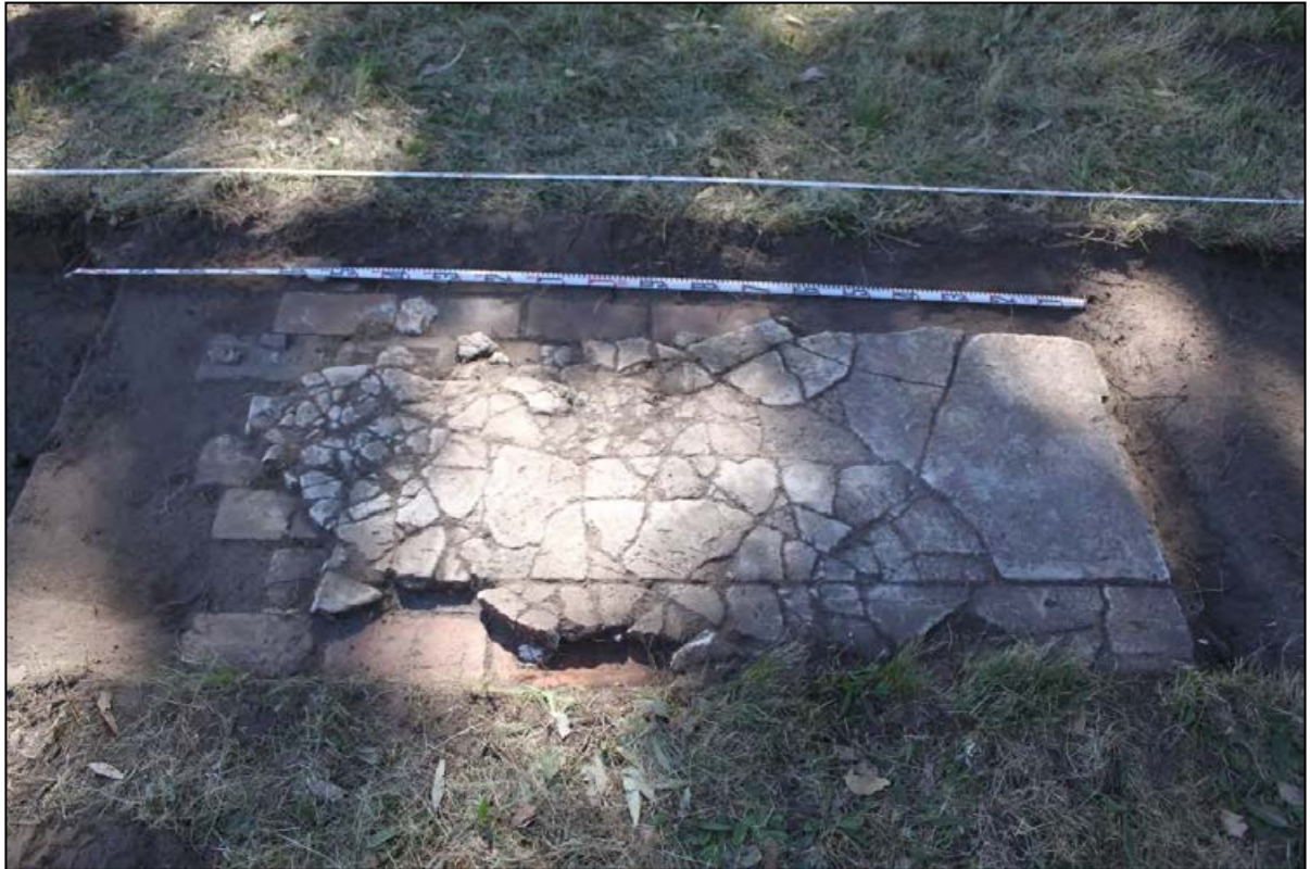
MHPAD1 Transect 7, concrete and brick floor, looking south