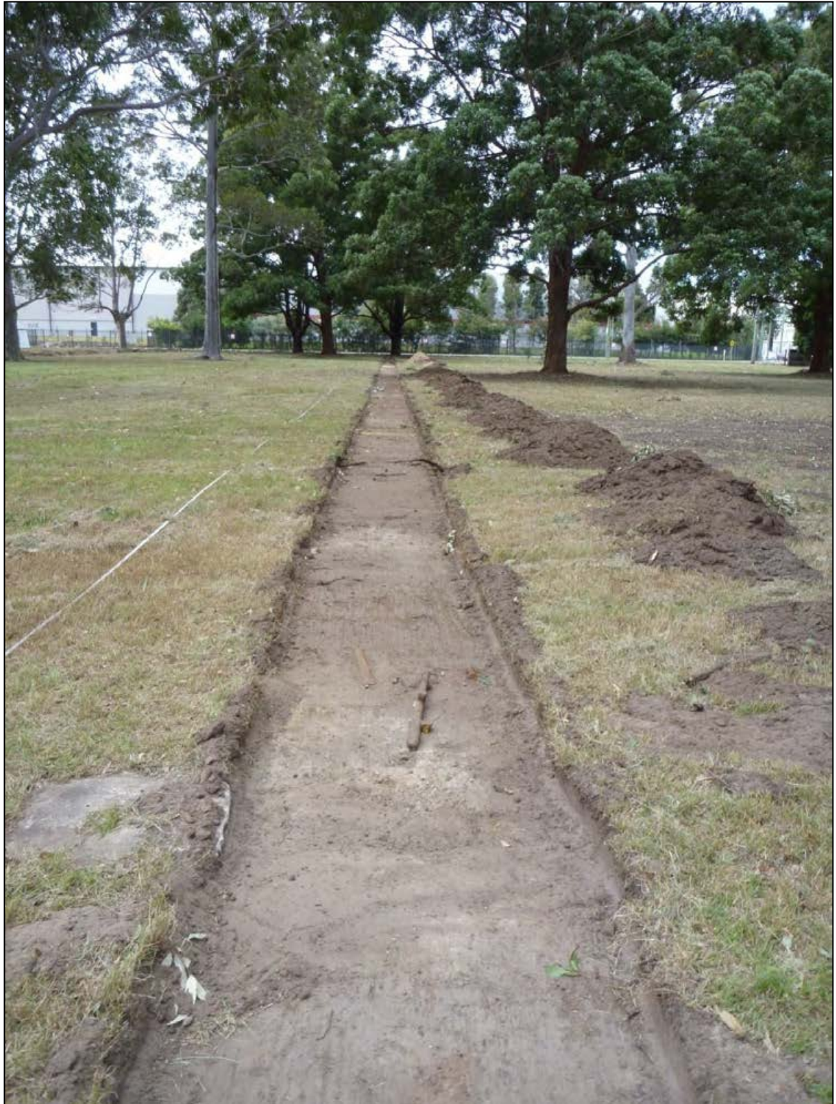
MHPAD1 Transect 6, looking east. Note concrete feature in bottom left and machine gun barrel in middle of trench