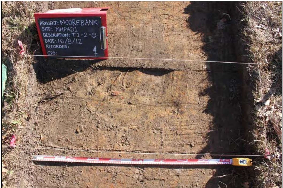
MHPAD1 Transect 1, Square 2, Context 1