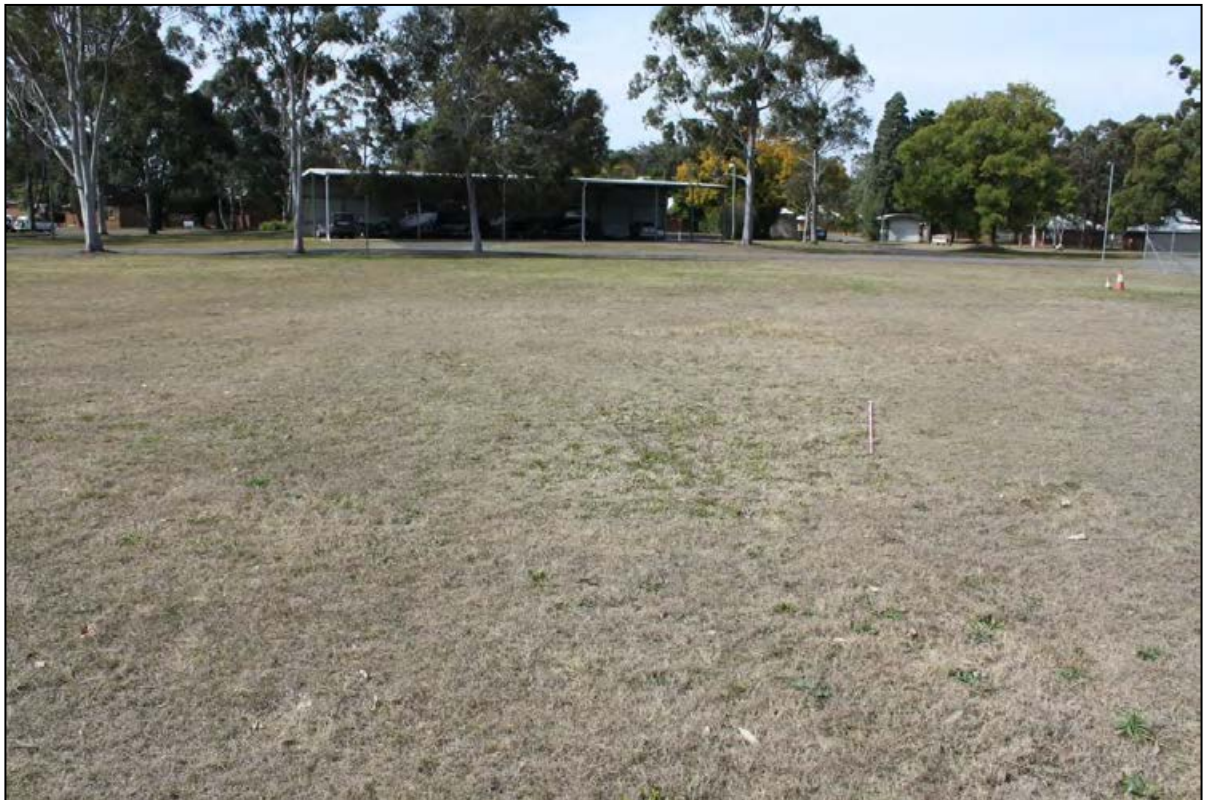
MHPAD2, general view across southern half, looking east