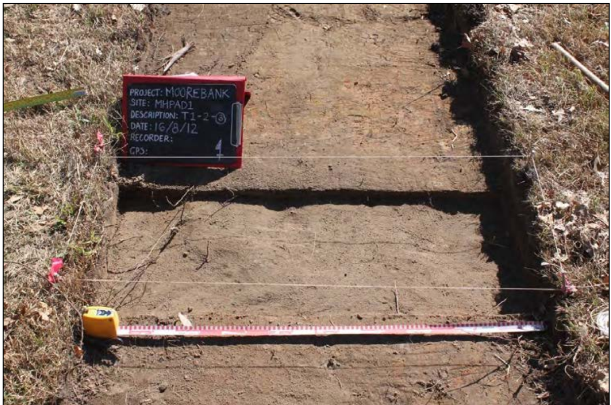
MHPAD1 Transect 1, Square 2, Context 3