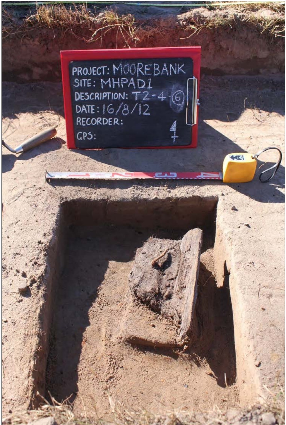
MHPAD1 Transect 2, Square 4, Context 6