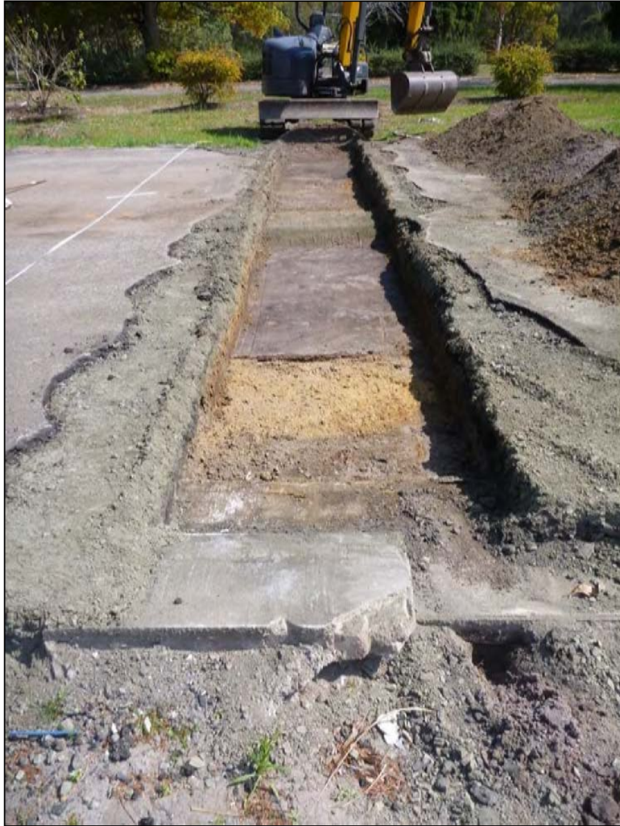
MHPAD3 Transect 1 Cut 4, looking west