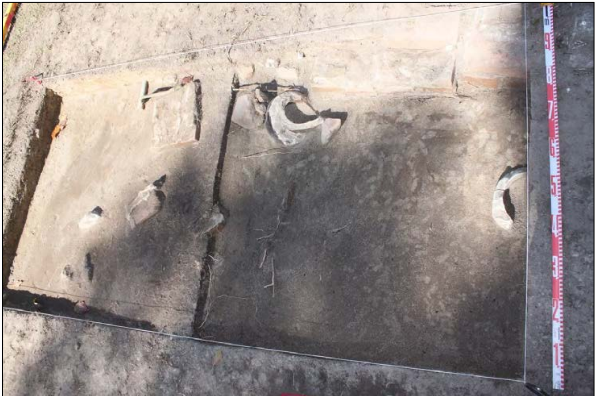
MHPAD2 – AG8a and AH8a- Context 9, looking south