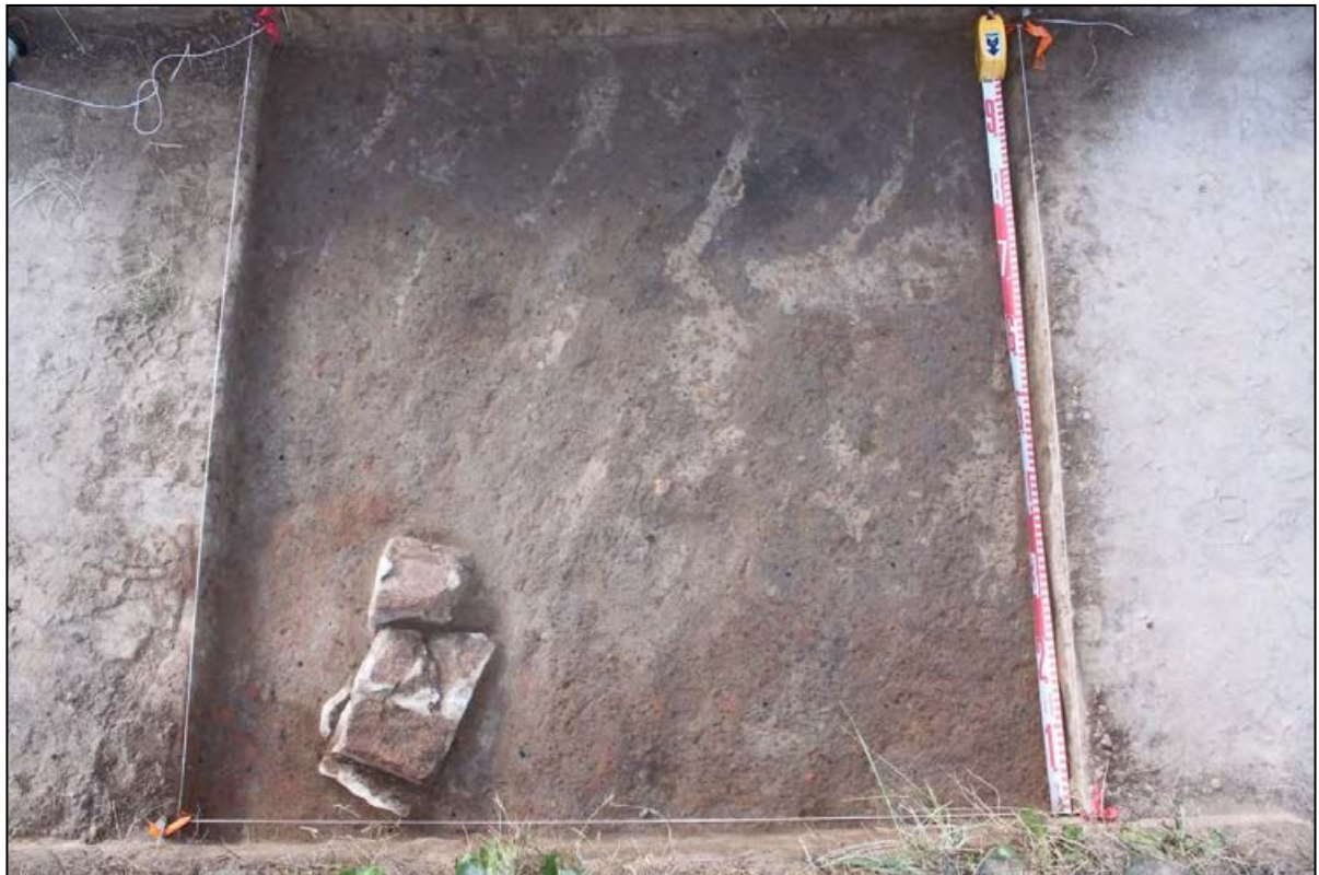
MHPAD1 Transect 2, Square 17, end of Context 4