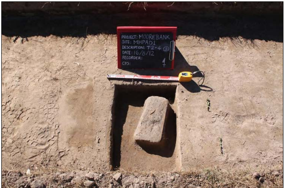
MHPAD1 Transect 2, Square 4, Context 5