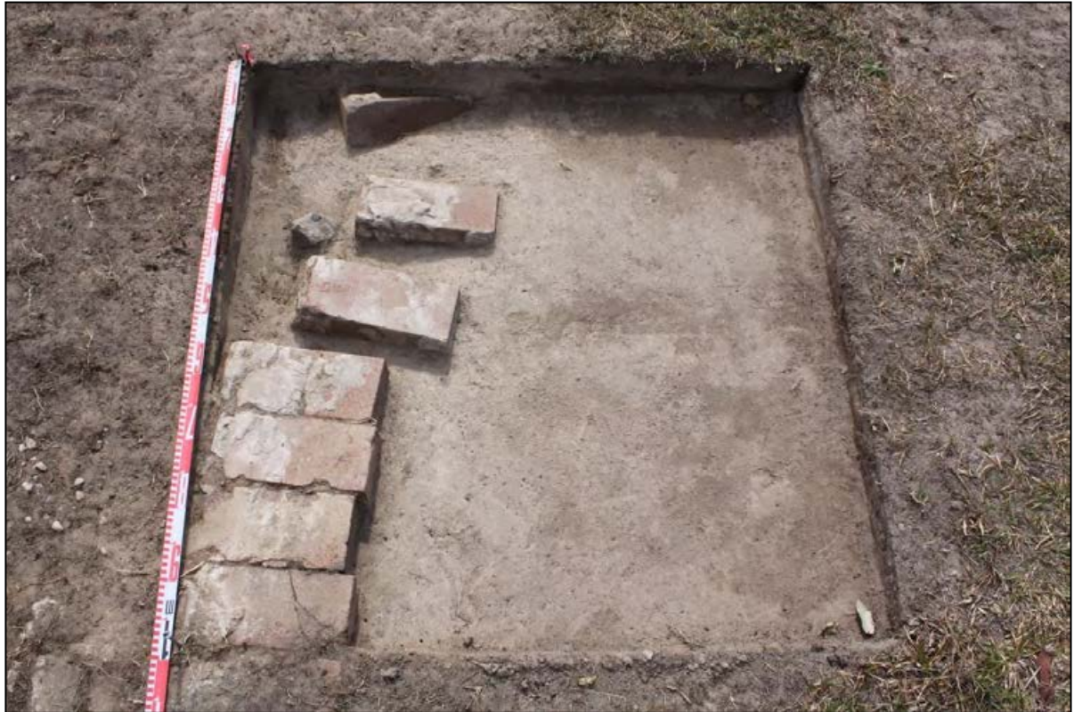
MHPAD2 - AE19 Context 3, looking north