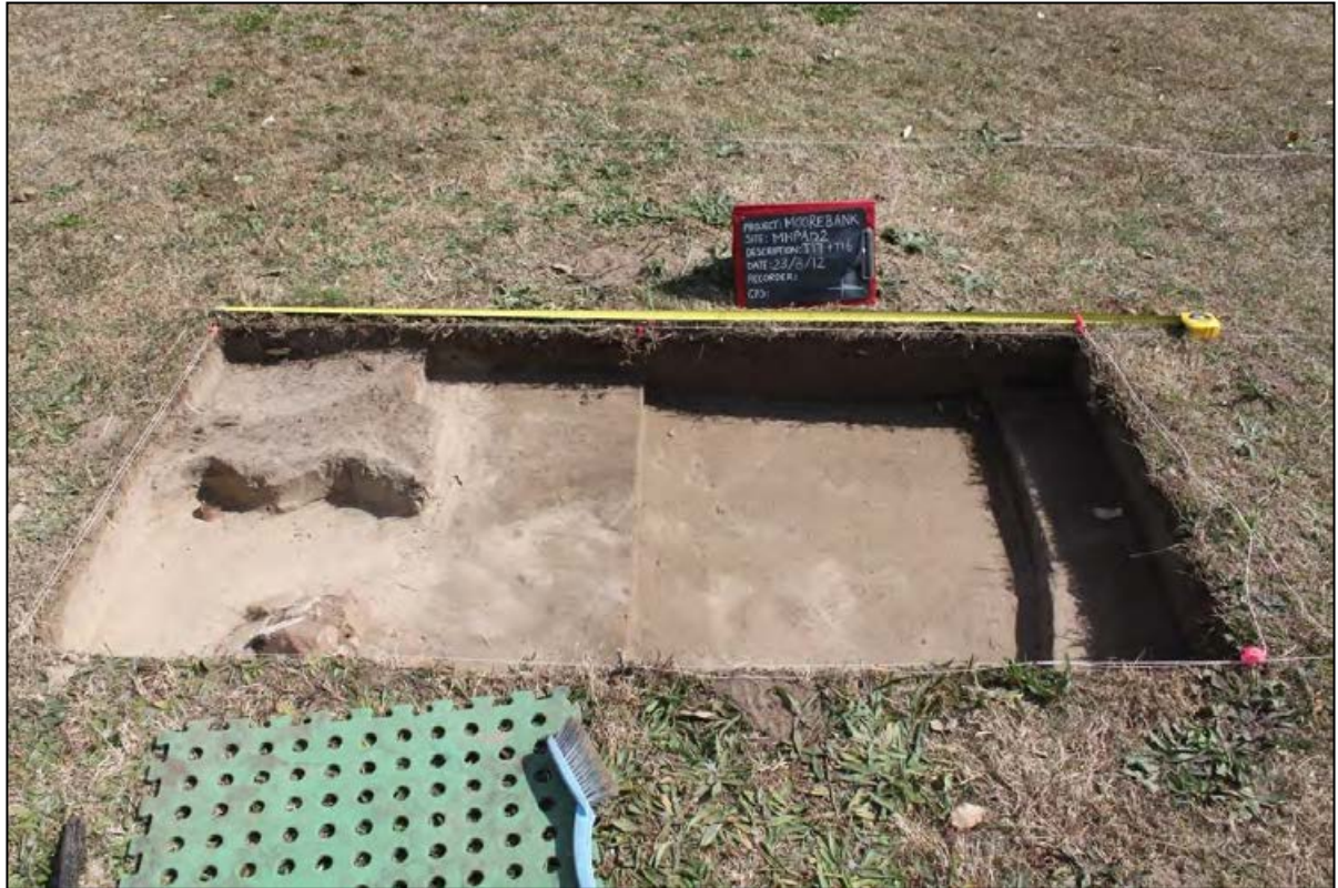
MHPAD2 – T167 and T17 Contexts 5 and 11, looking west