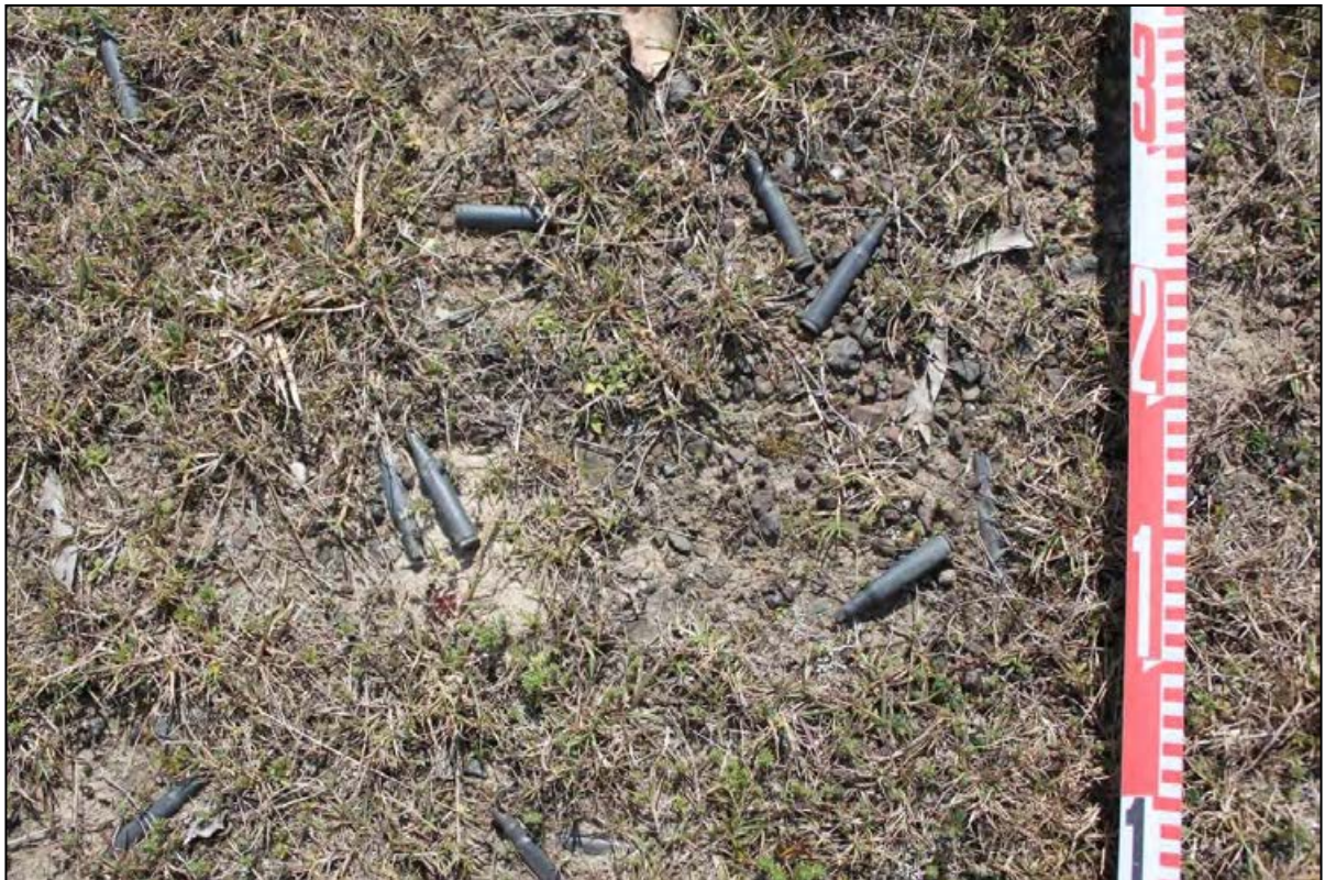
MHPAD2 – example of scatter of bullet casings on surface