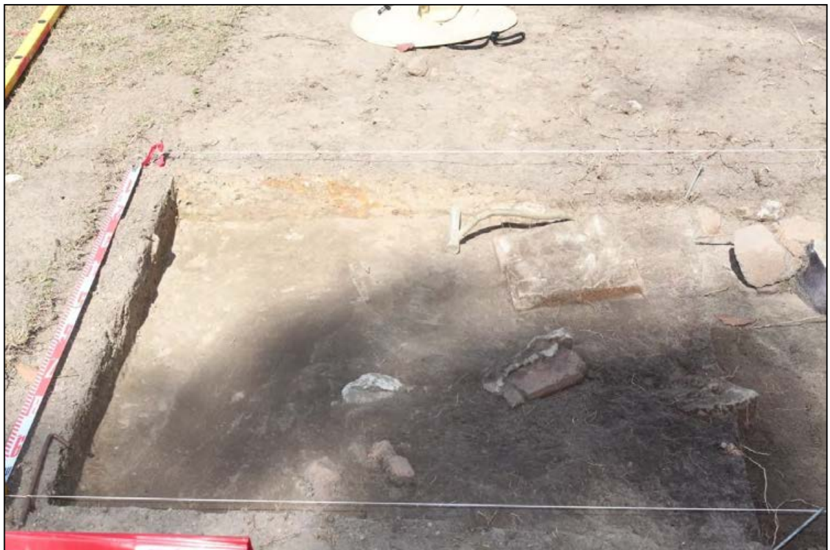
MHPAD2 – AH8a - Context 9, looking south