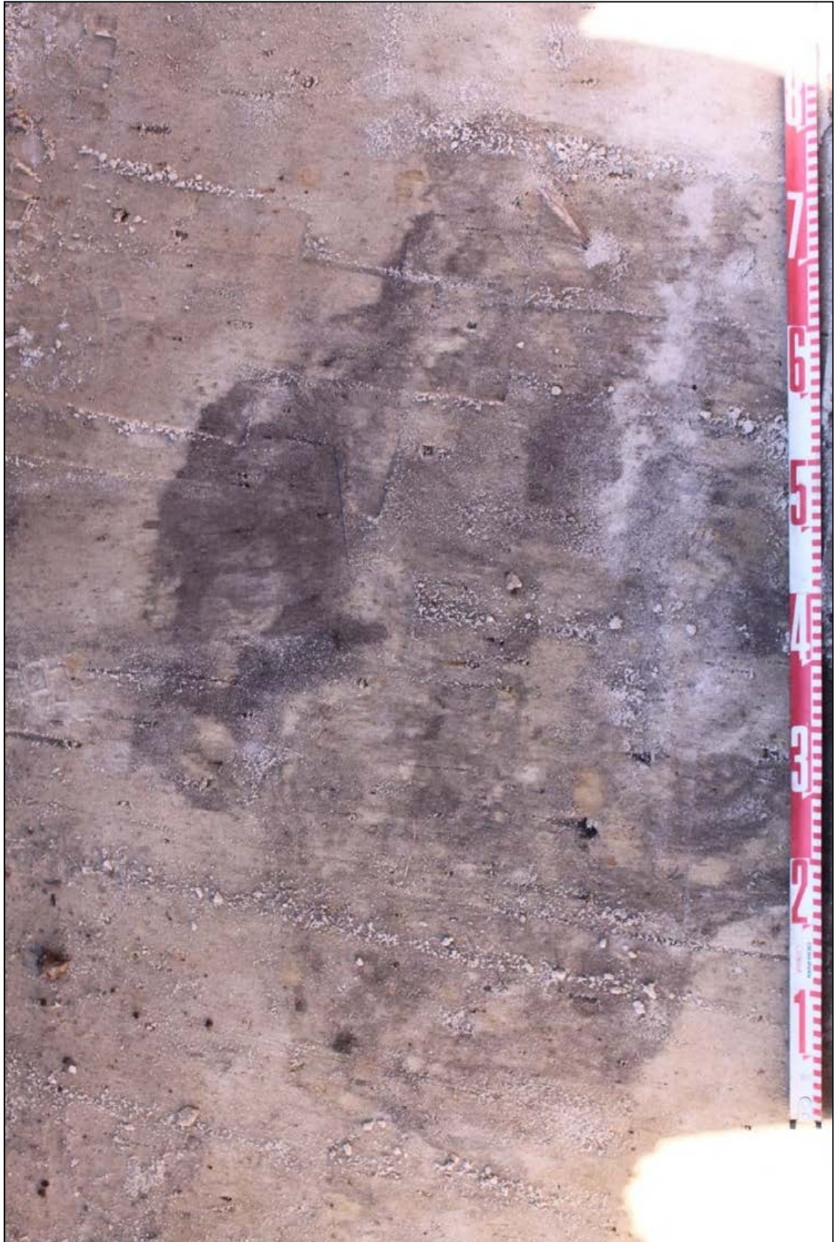
MHPAD1 Transect 8, cross-shaped feature exposed below old soil horizon