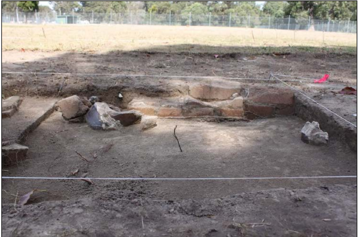
MHPAD2 – AG8a - Context 9, looking south