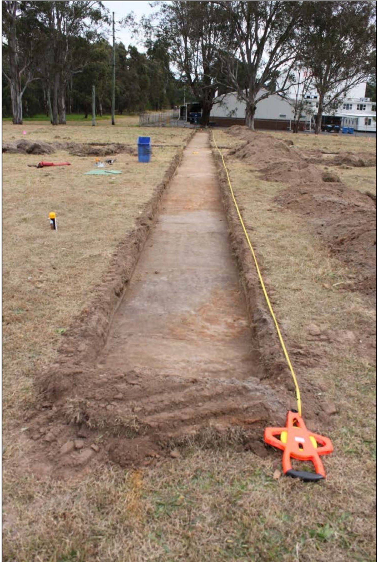
MHPAD1 Transect 2, looking west