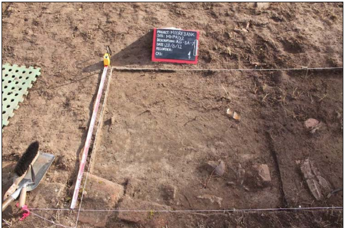
MHPAD2 – AG8a - Context 7