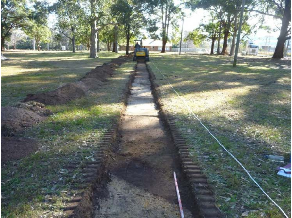
MHPAD1 Transect 5, looking west across diagonal path towards central road feature