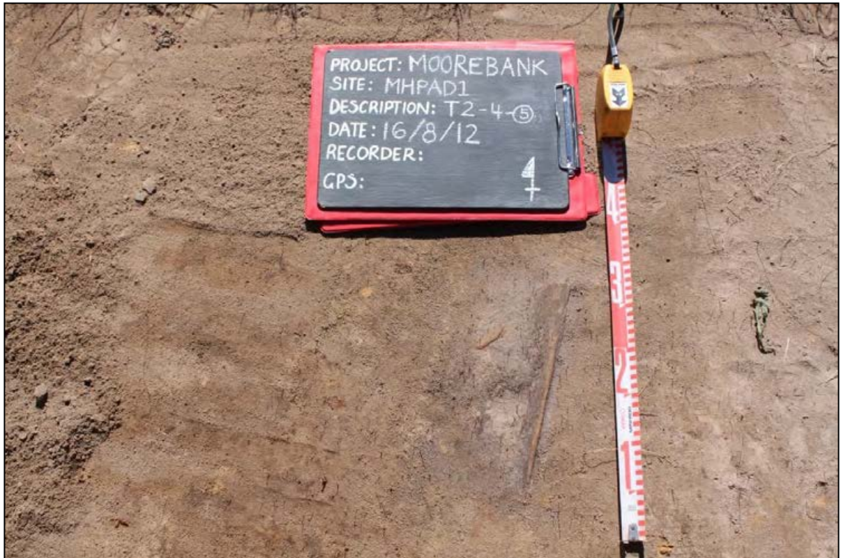
MHPAD1 Transect 2, Square 4, Context 5 – prior to excavation