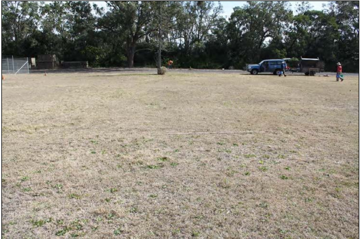
MHPAD2, general view across southern half, looking west