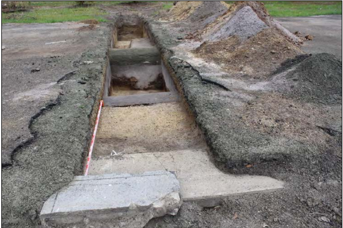
MHPAD3 Transect 1 at completion of mechanical excavation, looking west