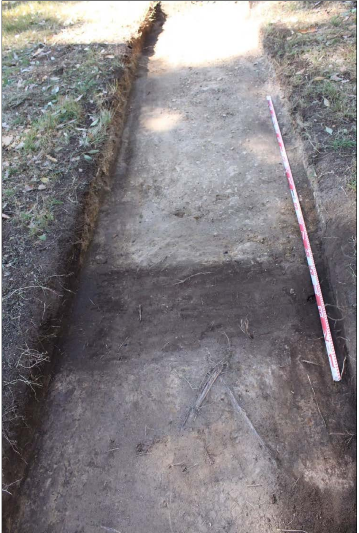
MHPAD1 Transect 5, central road feature, looking east