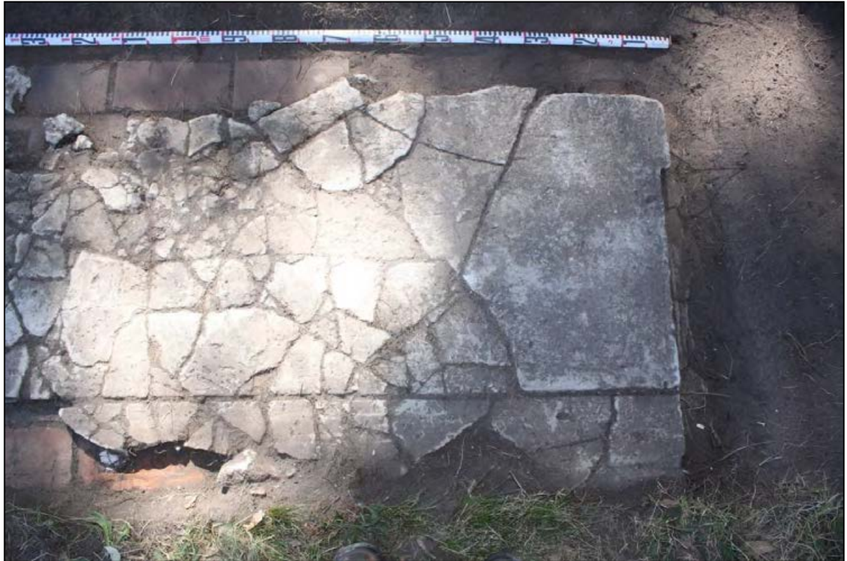
MHPAD1 Transect 7, details of concrete and brick floor, looking south