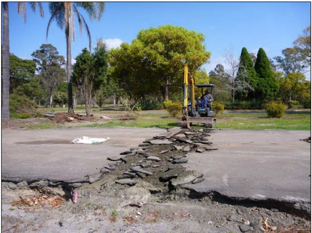
MHPAD3 Transect 1, removal of road surface, looking west