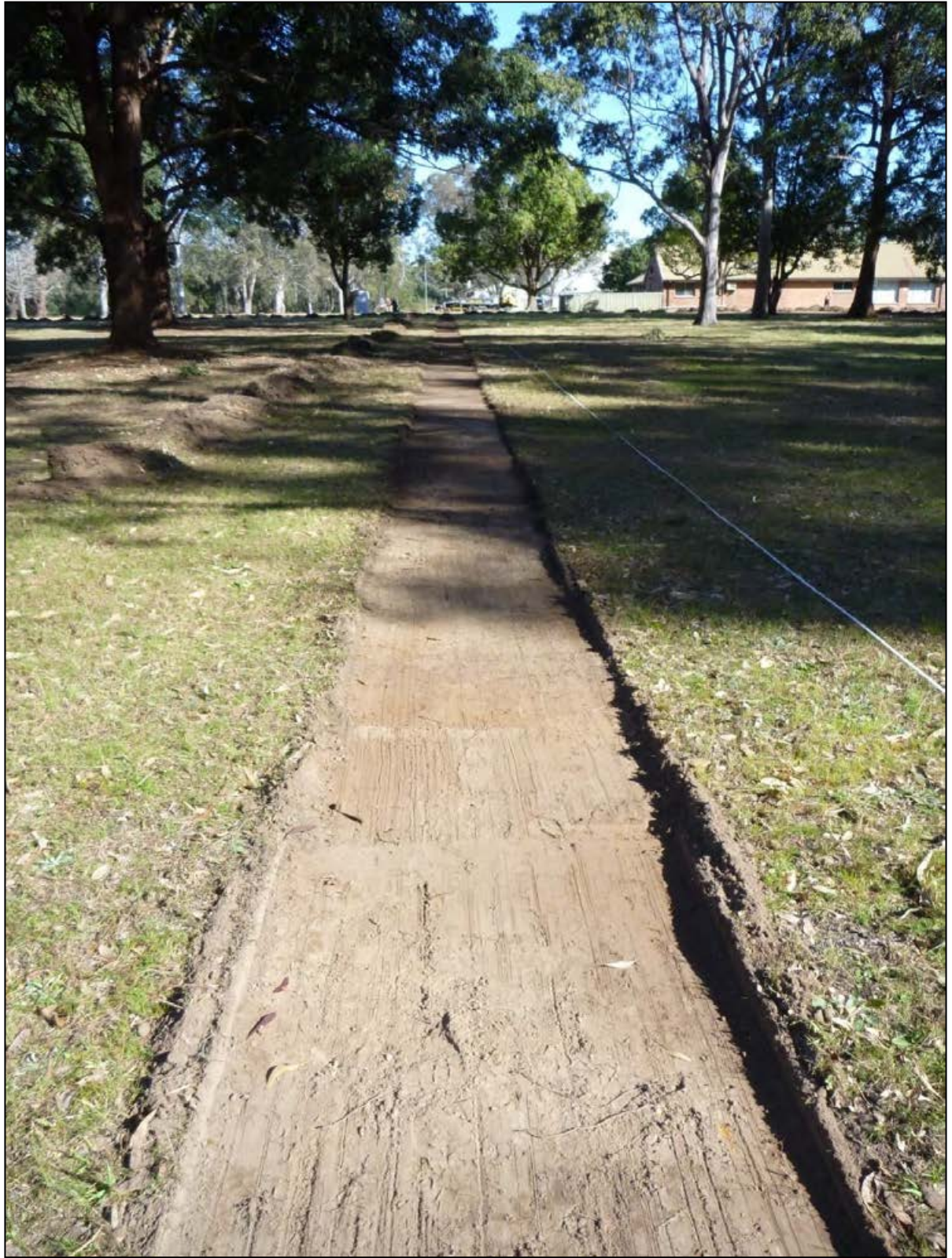
MHPAD1 Transect 6, looking west