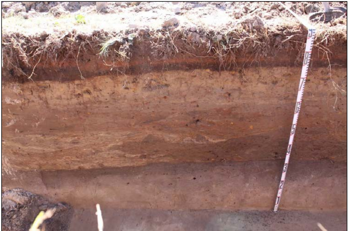
MHPAD1 Transect 8, northern profile showing layers of fill over old soil horizon