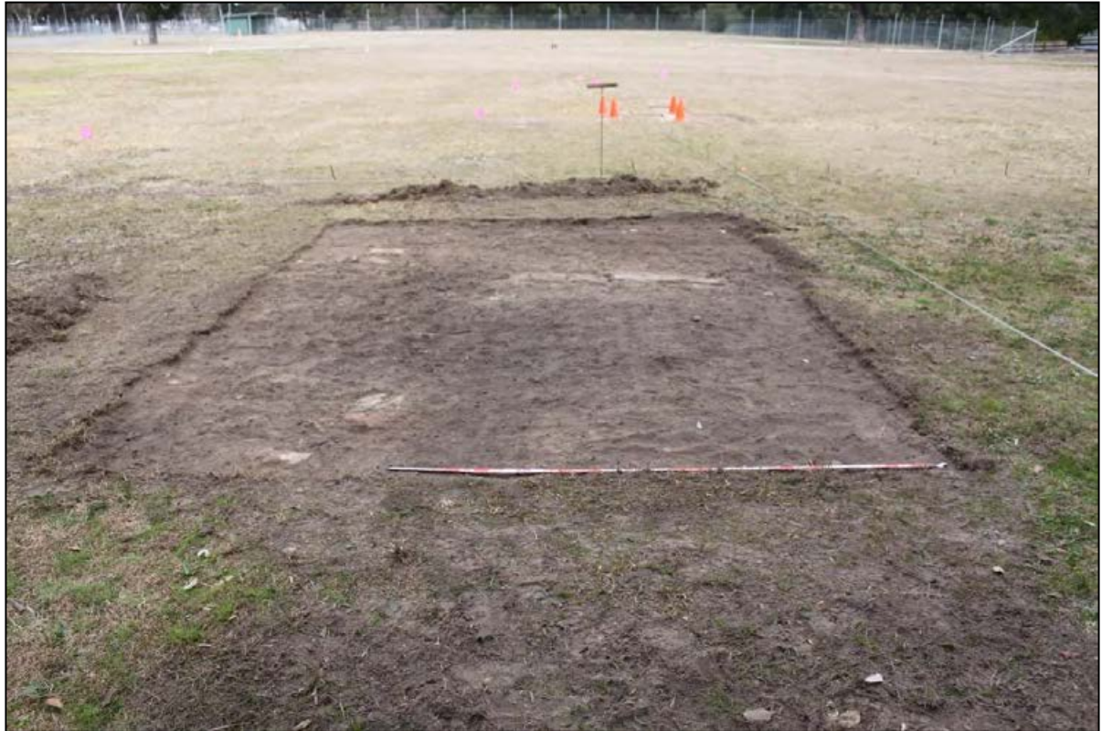
MHPAD2 – Context 1 removed across area centring on AG8 and AH8