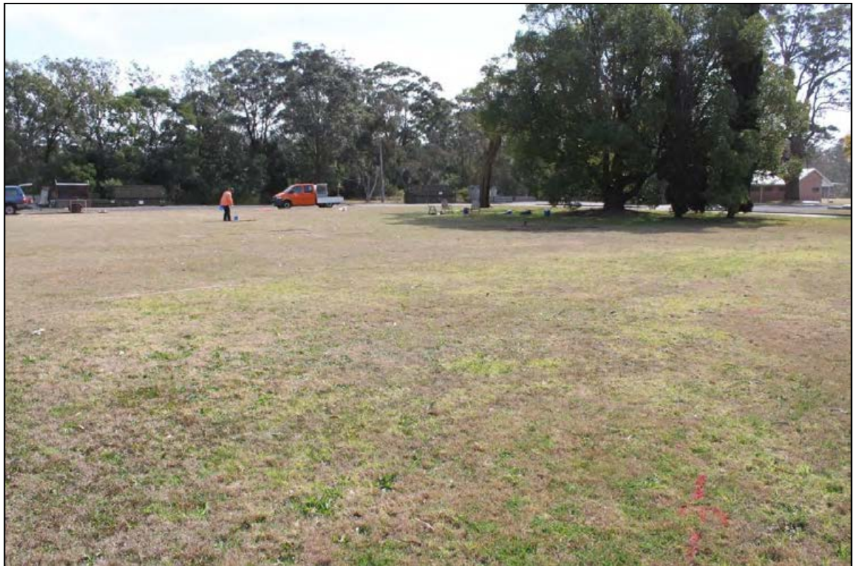
MHPAD2, general view across northern half, looking northwest