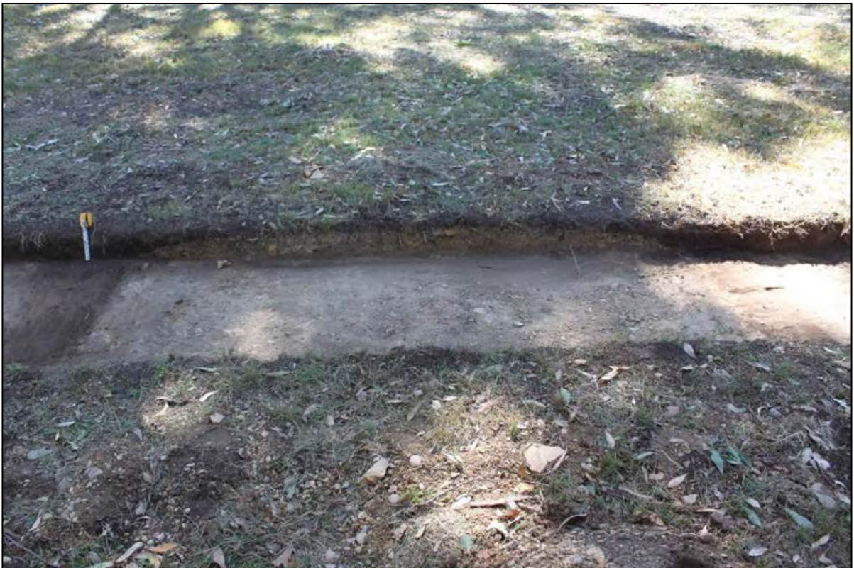
MHPAD1 Transect 5, central road feature, looking north