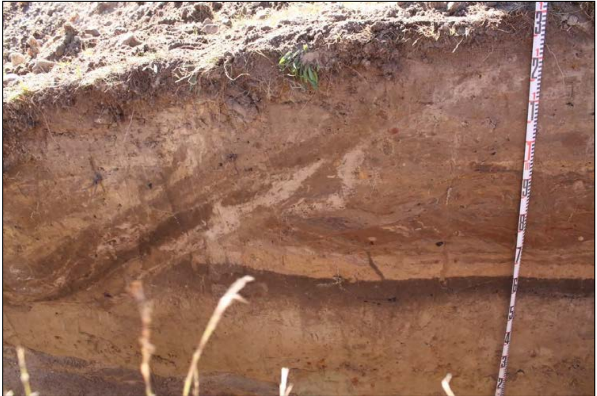
MHPAD1 Transect 8, northern profile showing layers of fill over old soil - horizon western end