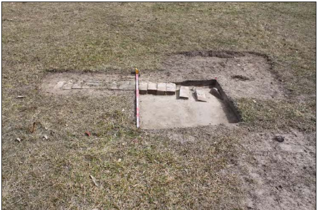
MHPAD2 - AE19 Context 3, looking west