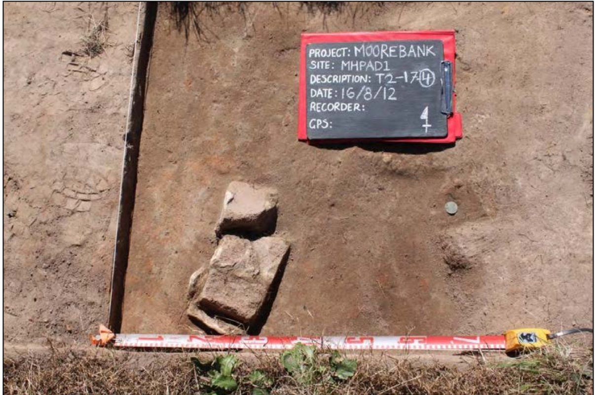
MHPAD1 Transect 2, Square 17, Context 4