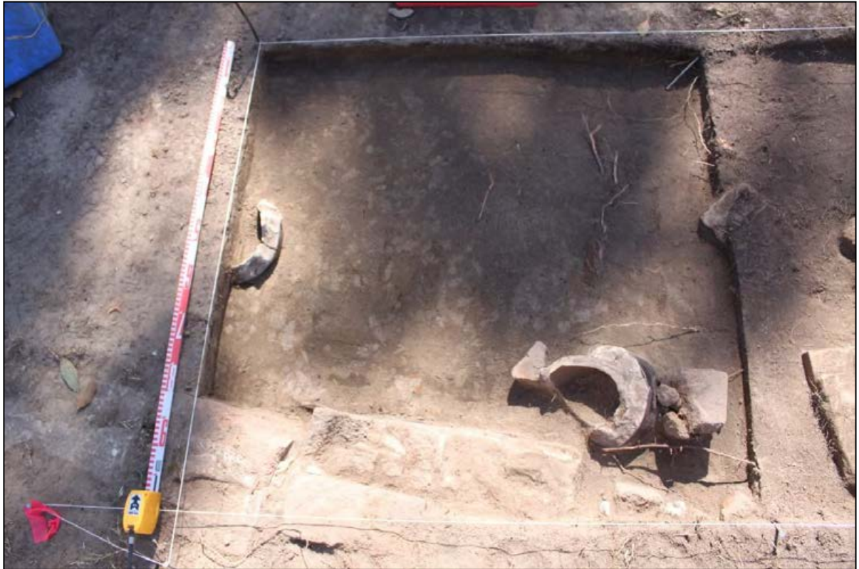
MHPAD2 – AG8a - Context 9, looking north