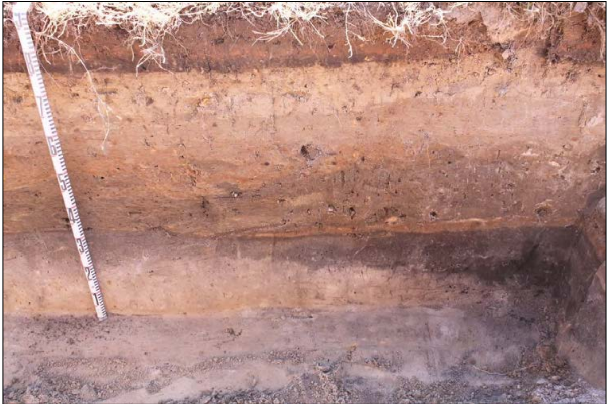
MHPAD1 Transect 8, northern profile showing layers of fill over old soil horizon – eastern end