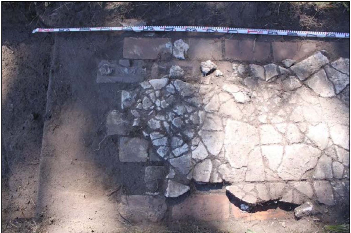
MHPAD1 Transect 7, details of concrete and brick floor, looking south