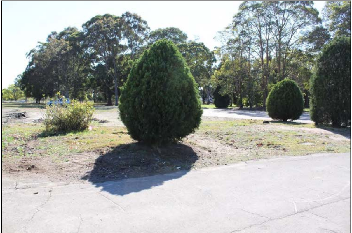
MHPAD3, garden area where hand excavation was conducted, looking northeast