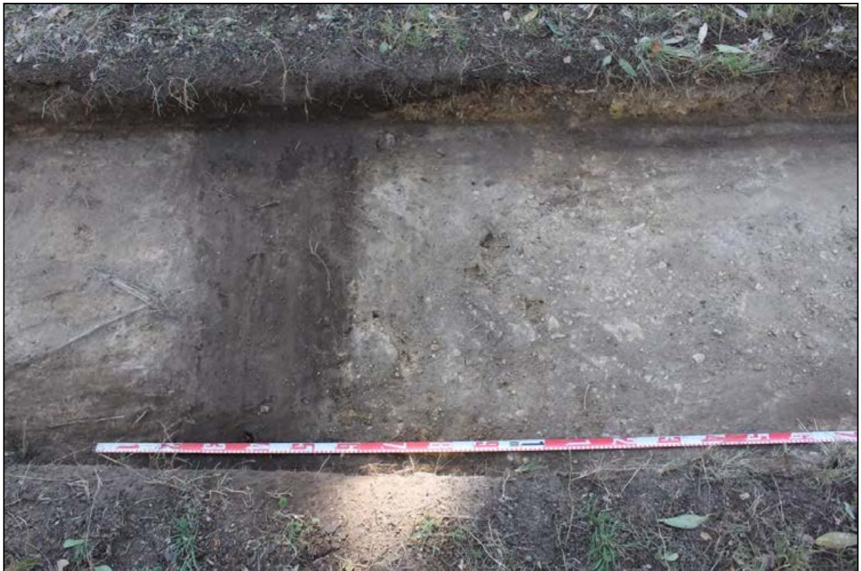
MHPAD1 Transect 5, western edge of central road feature